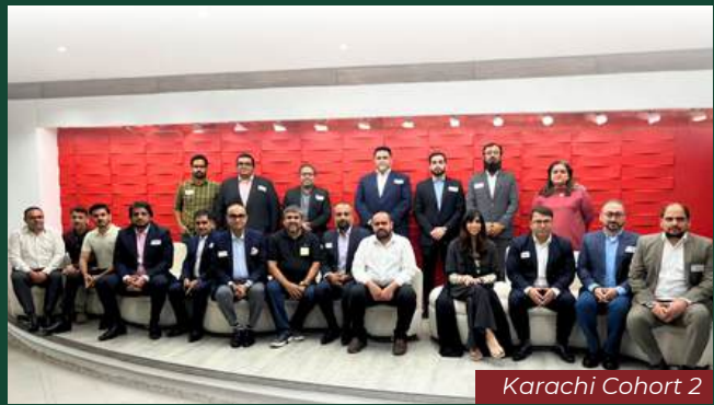
Karachi Cohort 2