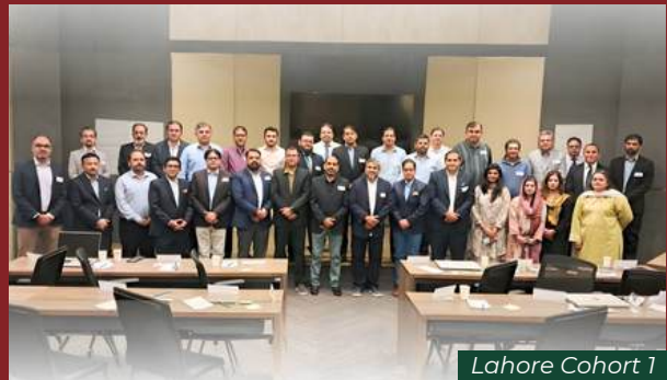
Lahore Cohort 1