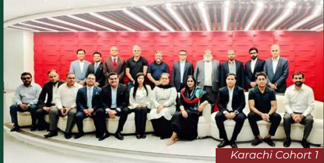
Karachi Cohort 1