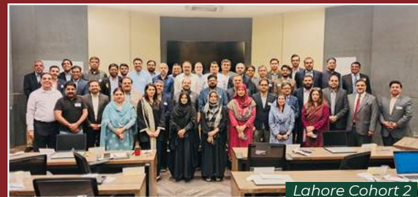
Lahore Cohort 2